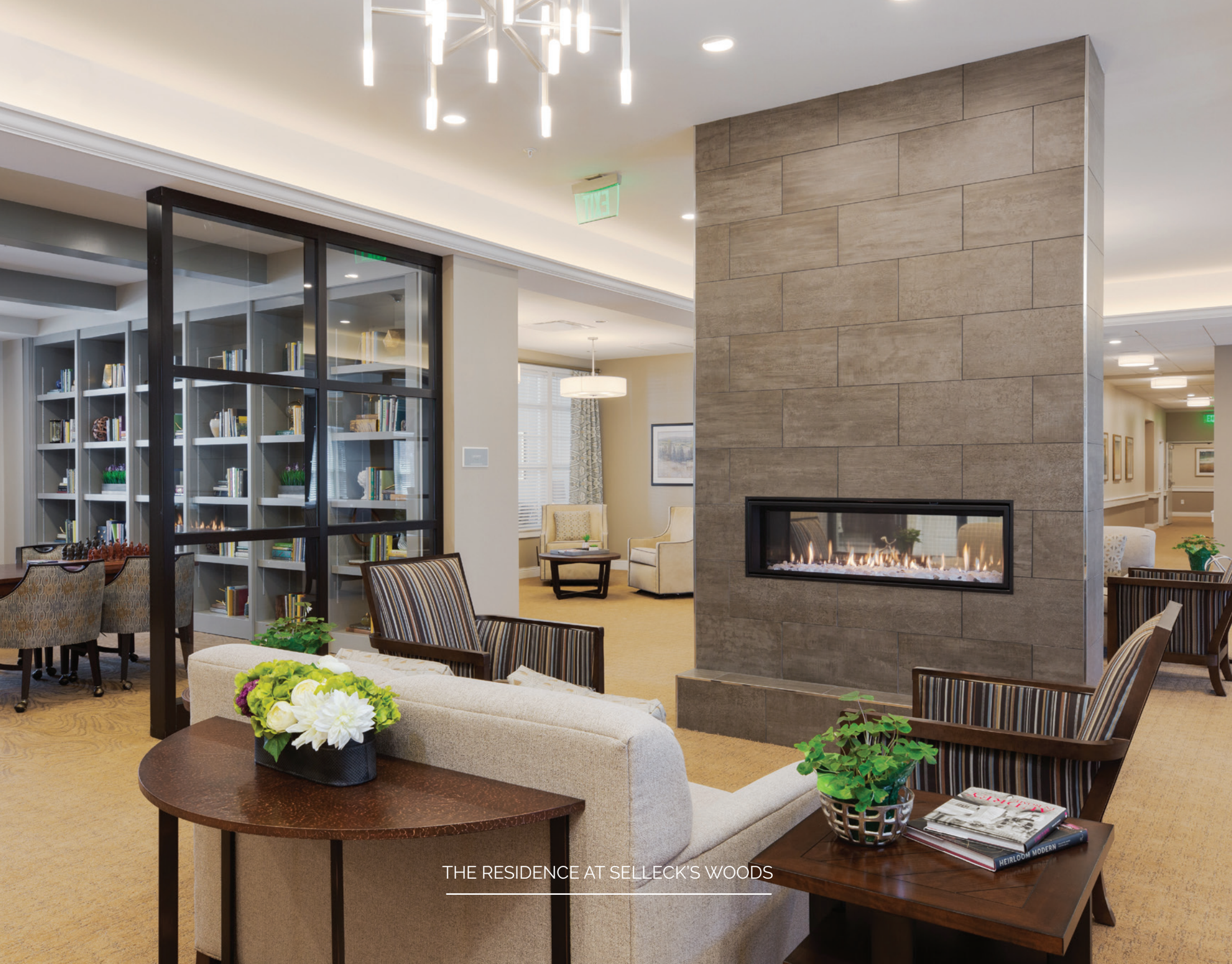
THE RESIDENCE AT SELLECK'S WOODS